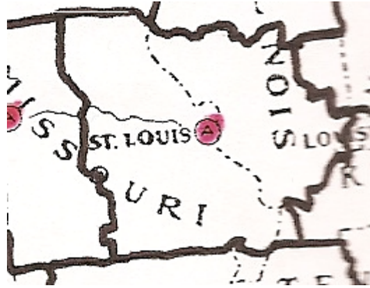
SALES AREA FOR FORD'S ASSEMBLY PLANT IN ST. LOUIS, MISSOURI FROM THE 1926 ISSUE OF FORD INDUSTRIES