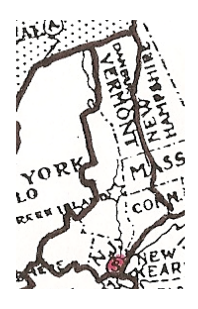
SALES AREA FOR FORD'S ASSEMBLY PLANT IN KEARNY, NEW JERSEY FROM THE 1926 ISSUE OF FORD INDUSTRIES