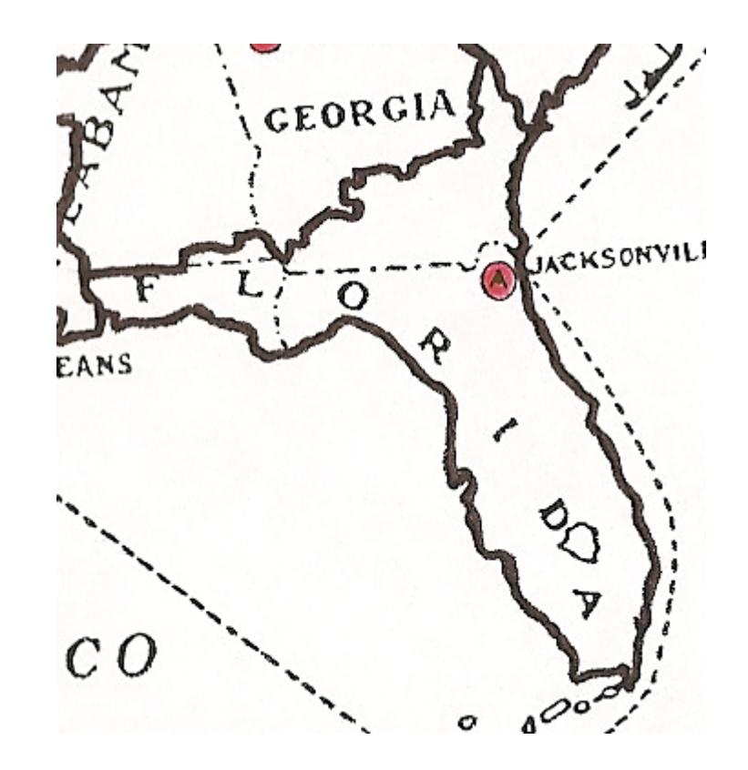
SALES AREA FOR FORD'S ASSEMBLY PLANT IN JACKSONVILLE, FLORIDA FROM THE 1926 ISSUE OF FORD INDUSTRIES