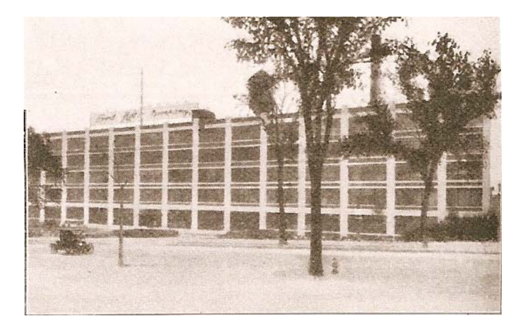
DES MOINES, IOWA