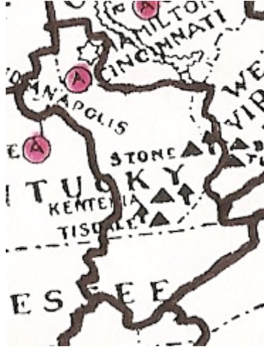
SALES AREA FOR FORD'S ASSEMBLY PLANT IN CINCINNATI, OHIO FROM THE 1926 ISSUE OF FORD INDUSTRIES